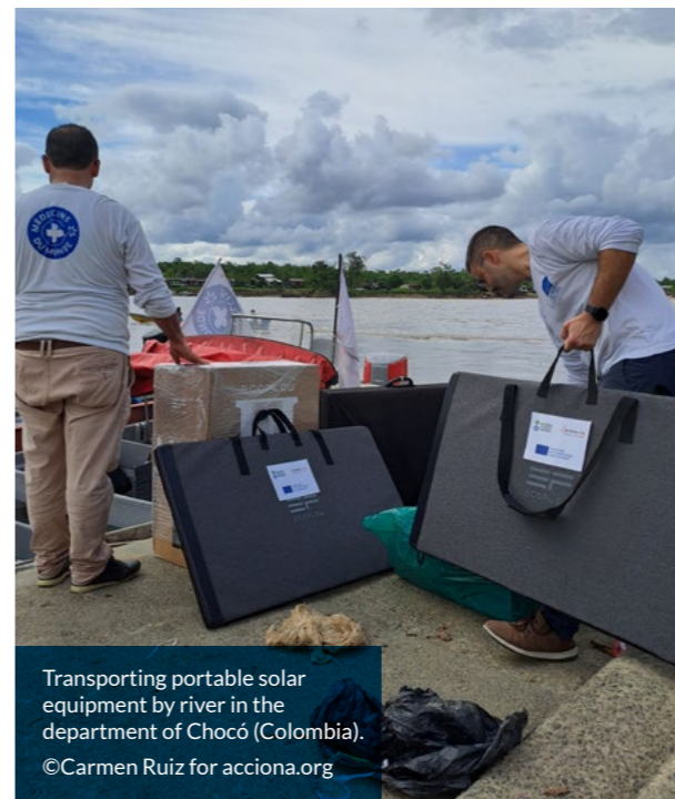
Transporting portable solar equipment by river in the department of Chocó (Colombia).

tion as a catalyst for transformation and aims to highlight the need to implement the use of renewable energy on a large scale, based on an application based on reliable data and with a practical, transparent and participatory perspective. We also seek to put the issue of fossil fuel use on the political and social agenda when providing humanitarian assistance in emergency areas.