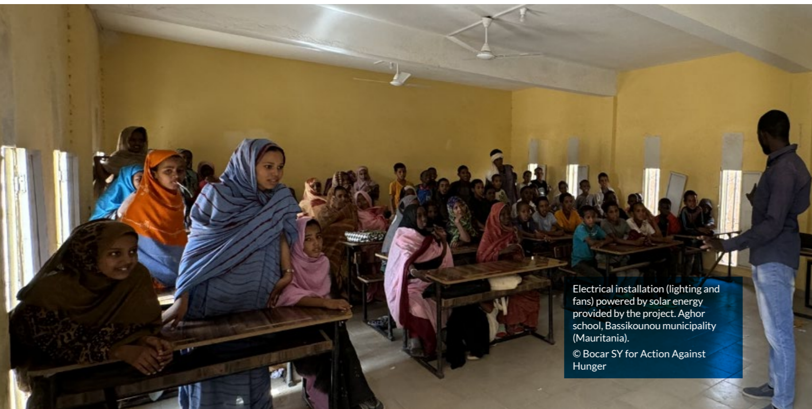
Electrical installation (lighting and fans) powered by solar energy provided by the project. Aghor school, Bassikounou municipality (Mauritania).

By generating a renewable energy measurement and management tool, the project aims to func-